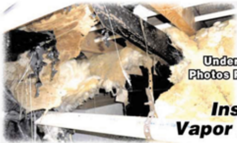
Underhome Photos Provided

Insulation Under Your Home Falling Down? Holes and Tears in Your Vapor /Moisture Barrier?