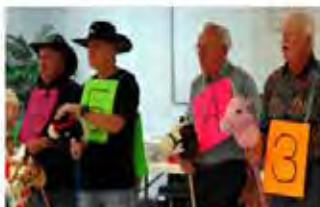
Night at the Races