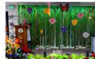
Silly Spring Fashion Show