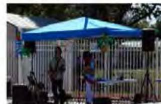
Aloha Snowbirds Party