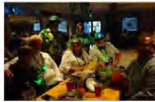
St. Patrick's Day