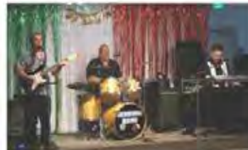
Cinco de Mayo