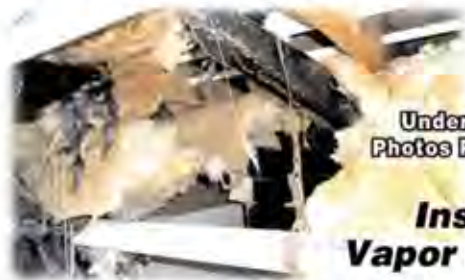
Underhome Photos Provided

Insulation Under Your Home Falling Down? Holes and Tears in Your Vapor /Moisture Barrier?